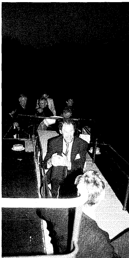
Evening cruise up the Wanganui River — 1998 AGM.