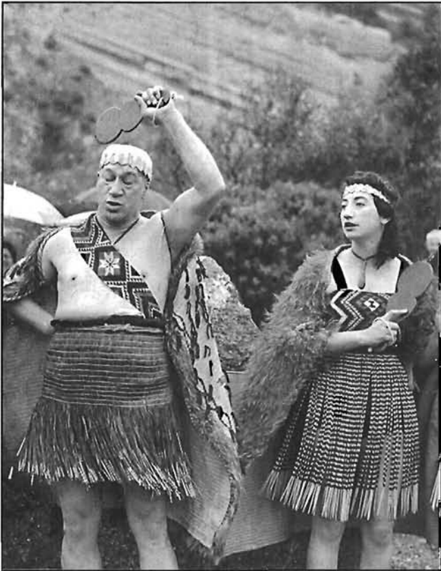
Sir Eruera Tihema Tirikatene. Attending the Greymouth Centennial Celebrations, May 1959.