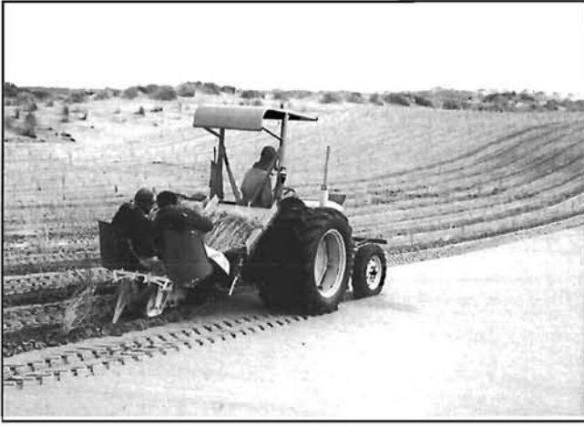
Planting marram grass using single furrow planter, May 1964.